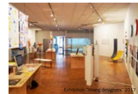
Exhibition "Young designers" 2017