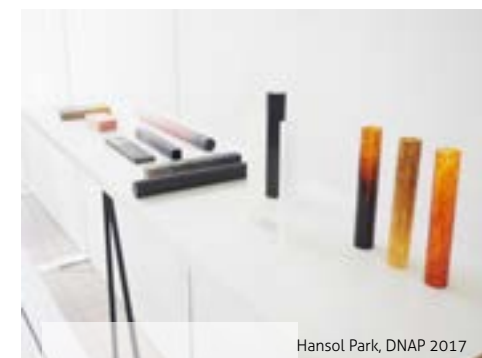
Hansol Park, DNAP 2017