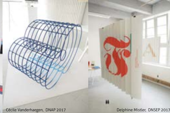
Cécile Vanderhaegen, DNAP 2017