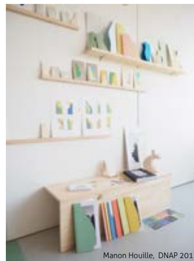
Manon Houille, DNAP 2017