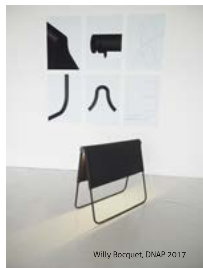
Willy Bocquet, DNAP 2017

Our purpose at ÉSAD Orléans is to educate and train professional designers who will become autonomous but who will also be able to work in teams, capable of responding and adapting to the change and needs of society. We want the students to find their own language of expression, their individual creative potential and their future pathway. Therefore the students are